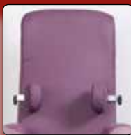
Foam head rest