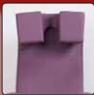
Head support cushion