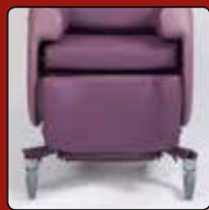
Leg rest channel cushion