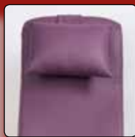
Soft head cushion