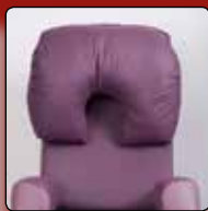
Profile head cushion