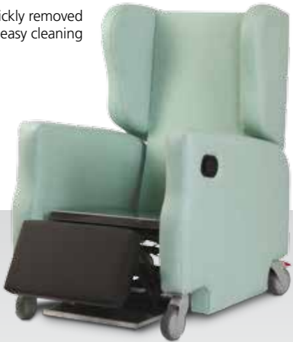
Cushions quickly removed for easy cleaning

All Push back, Single and Dual chairs can be manufactured to the infection control specification: Fully PVC covered areas for cleaning using a mild bleach solution, and no velcro or zips that can trap dirt. All the cushioning is attached using magnets which enable all the seat, quilt and back cushions to be removed quickly for cleaning.