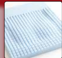
Primagel Gel pressure relief (medium / high risk)