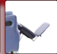
Removable footplate length adjustable