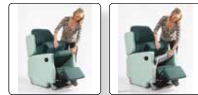
Fully removable seat and quilt. Different seat cushion modules available