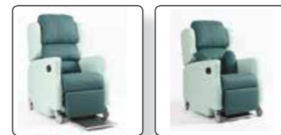
Foot tray extended. Lateral support cushions (optional extra)