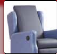
Careform backrest (Tredegar style)