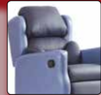
Soft fibre filled lateral supports (pair)