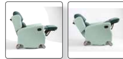
Normal recline. High leg recline.