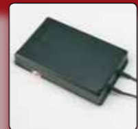
Freedom pack (Accupack) battery back up 40 cycles