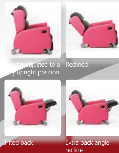
Adjusted to a fully upright position. Reclined. Tilted back. Extra back angle recline.