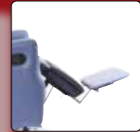
Removable footplate Length & angle adjustable