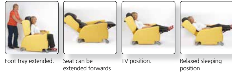
Foot tray extended. Seat can be extended forwards. TV position. Relaxed sleeping position.