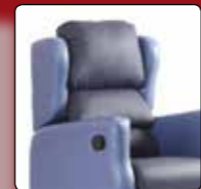
'Aircell' adjustable pressure waterfall back cushions